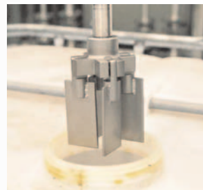
E-400 Folding Impeller Closed